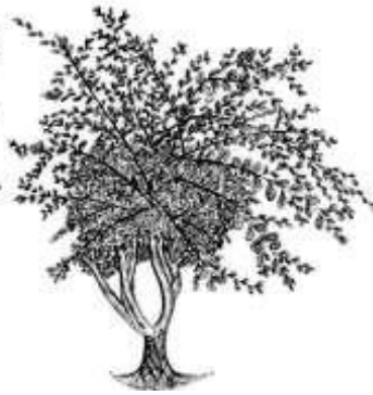
(5) Semi- Spreading