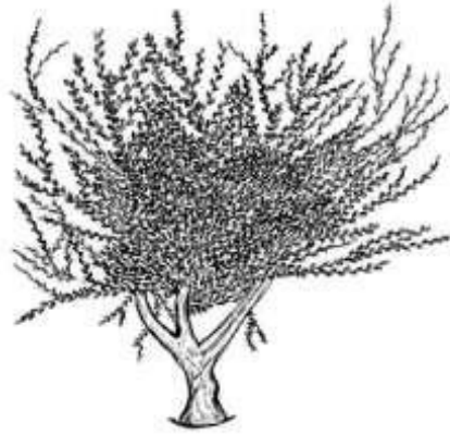
(3) Up right